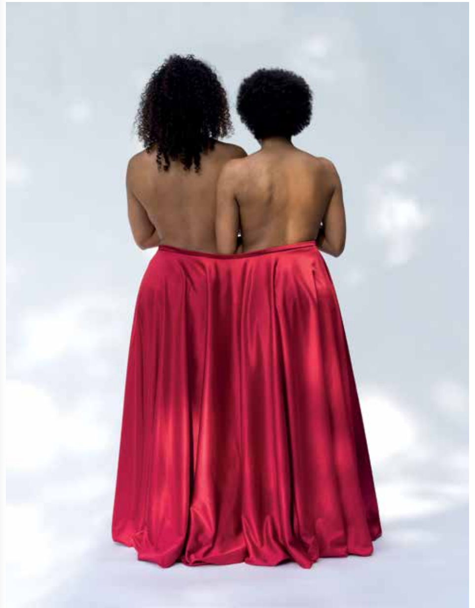
twinshipping 2016 c-print 110 x 84 cm