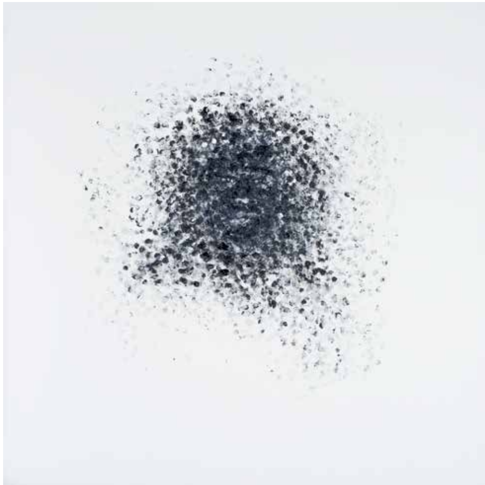
child of promise 2017 oil on canvas 100 × 100 cm