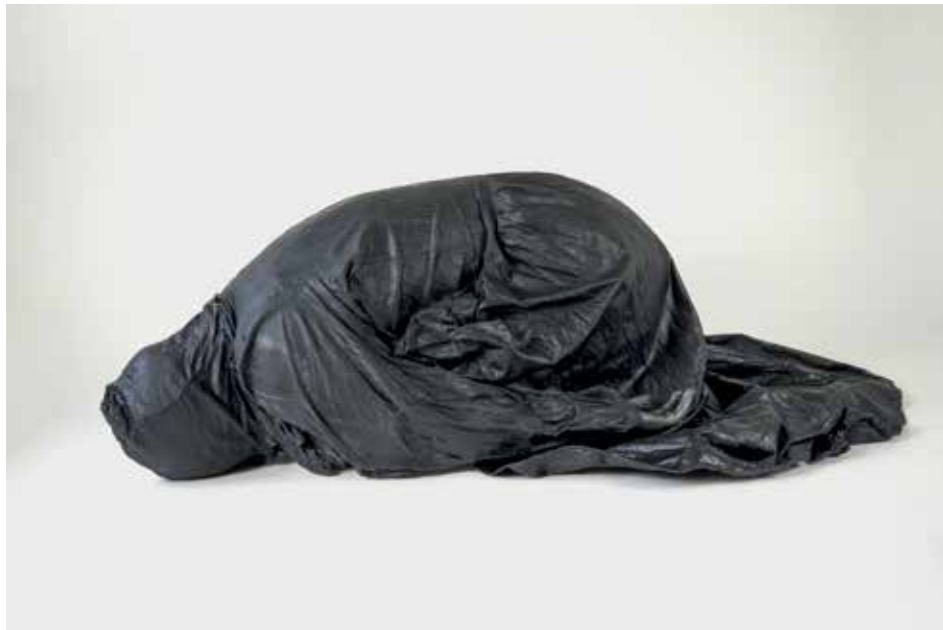
dark ease 2016 wax, canvas, pigment 148 x 51 x 113 cm