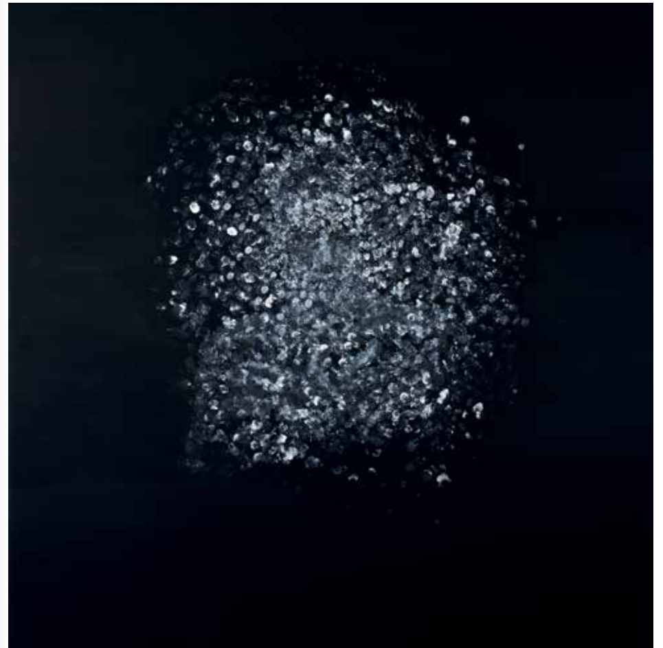
brother immersed 2017 oil on canvas 100 × 100 cm