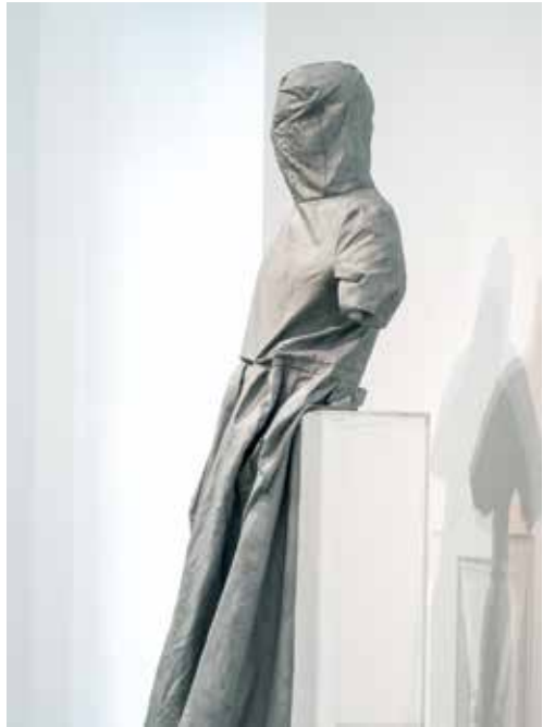
imperfect figure 2015 aluminium, acrylic glass 210 × 52 × 22 cm